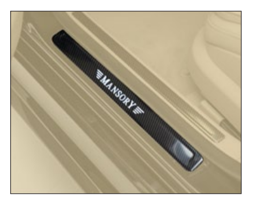
Entrance panels - Long version 22M 395 311 with logo

Set 4 pcs - front / rear, left / right visible carbon fibre glossy*