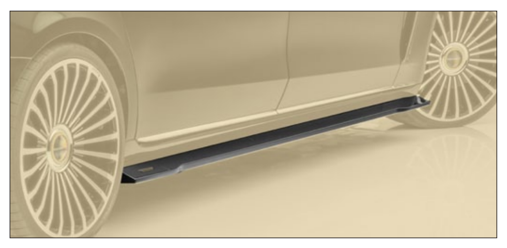
Side skirts lip, visible carbon - long version