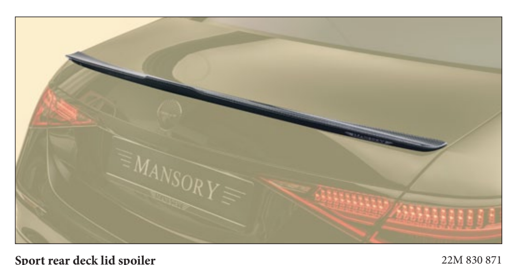
Sport rear deck lid spoiler visible carbon fibre primed without clear coat