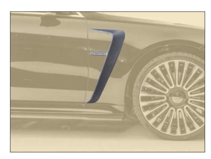
Air outtake for front fender

2 parts set - left & right, with logo visible carbon fibre without clear coat