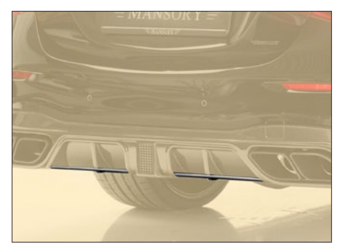
Visible carbon fibre diffuser board

2 parts set - left & right visible carbon fibre primed without clear coat