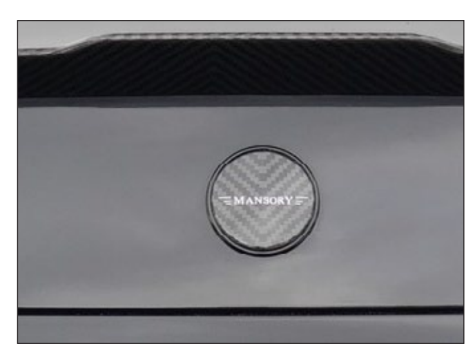
Rear hatch emblem - chrome ring22M 802 761Rear hatch emblem - black glosy ring22M 802 771

Mirror I. cover LHD 22M 523 751 2 parts set - left & right, visible carbon fibre glossy* Mirror I. housing LHD 2 parts set - left & right, visible carbon fibre glossy*