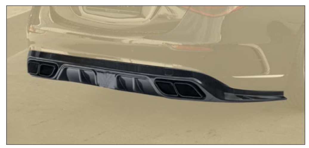
Rear diffuser 22M 802 021

visible carbon fibre without clear coat air intakes 3 parts set - left & right