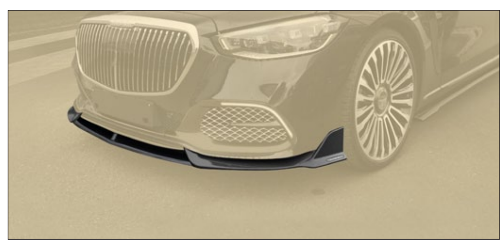
Front lip 22M 102 221

visible carbon fibre without clear coat air intakes, 5 parts set