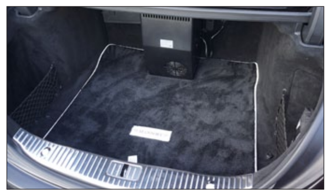
Velour trunk mat - with nubuck edging22M 368 758with MANSORY logo stitching

4-parts set - for front / rear foot area left / right available with MANSORY logo stitching