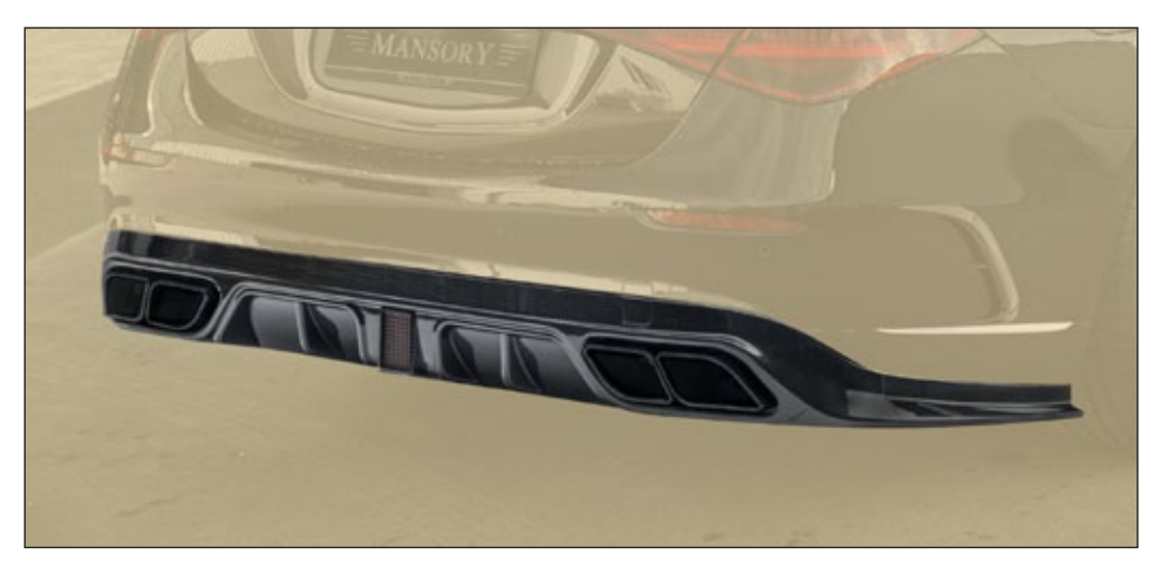
Rear diffuser with Race brake light

visible carbon fibre without clear coat. exhaust blinds