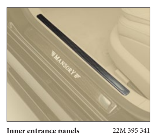
Inner entrance panels for long version

Set 4 pcs - front / rear, left / right black brushed aluminium