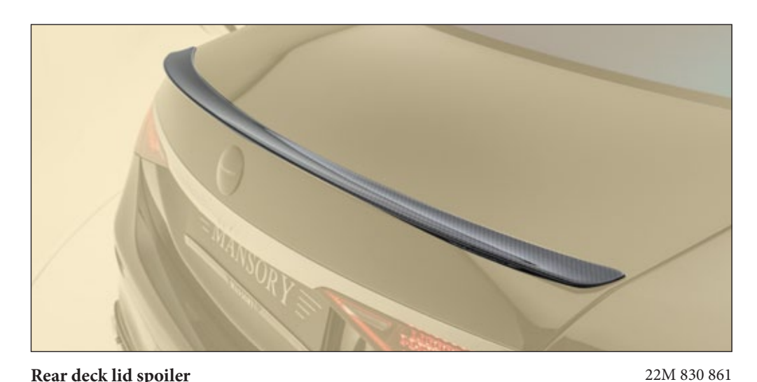
Rear deck lid spoiler visible carbon fibre primed without clear coat