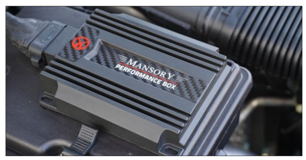
MANSORY Performance PowerBox

2 level adjusting rods front axle, 2 level adjusting rods rear axle Lowering of approx 20-30 \rm mm