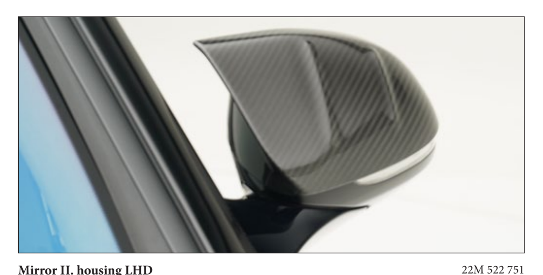
Mirror II. housing LHD 2 parts set - left & right, visible carbon fibre glossy*