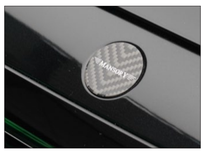
Front bumper emblem with logo 22M 102 741 visible carbon fibre glossy*