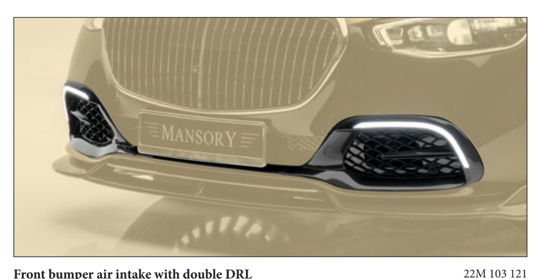
Front bumper air intake with double DRL

visible carbon fibre without clear coat air intakes, 5 parts set