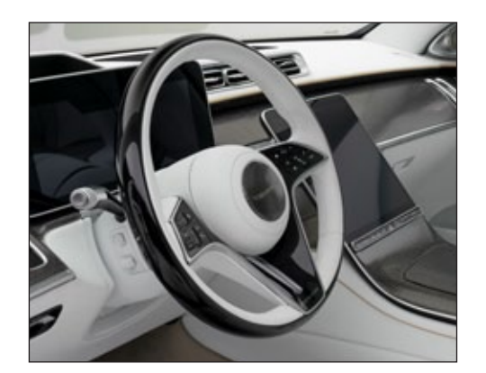
Sport steering wheel