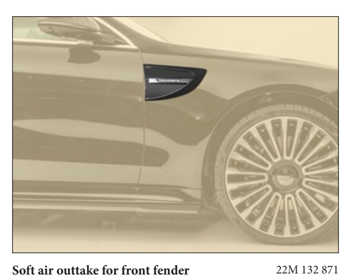
Soft air outtake for front fender

2 parts set - left & right, with logo visible carbon fibre without clear coat