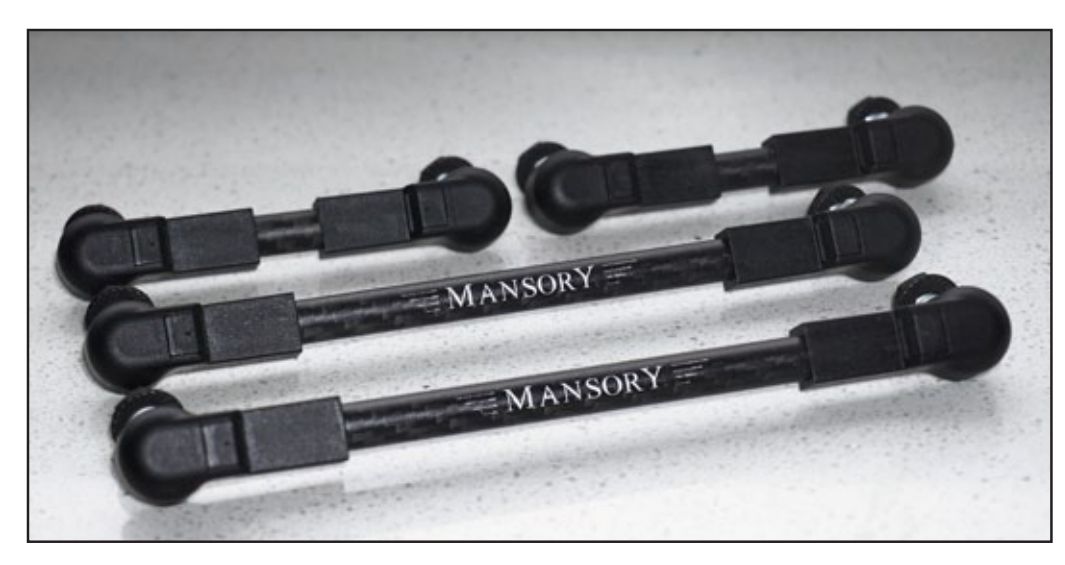
MANSORY Lowering Suspension for Mercedes-Benz S-Class W223