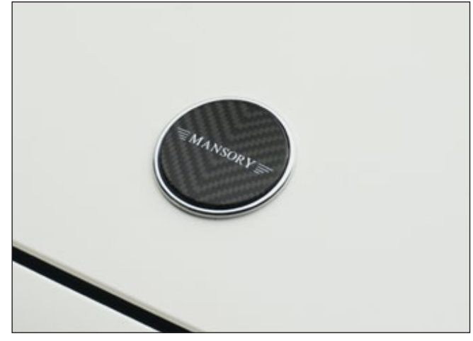
Engine bonnet emblem - chrome ring 22M 102 665 Engine bonnet emblem - black glosy ring with logo visible carbon fibre glossy*