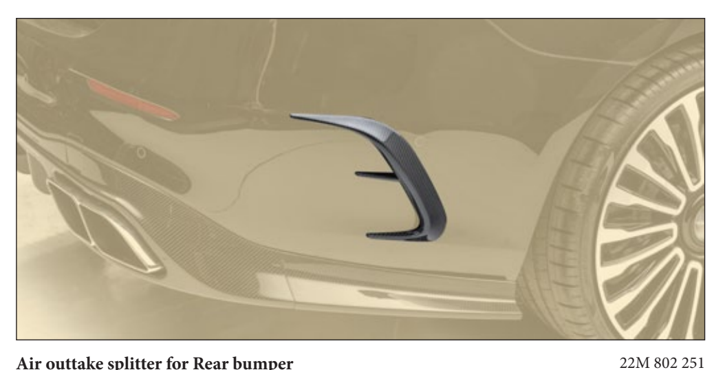
Air outtake splitter for Rear bumper 2 parts set - left & right visible carbon fibre without clear coat