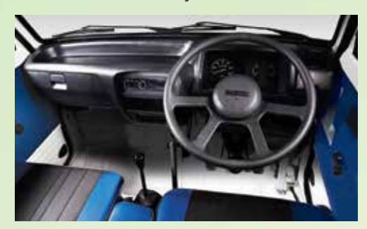
Newly designed instrument panel with New 4 spoke steering.

With upgraded features and advanced Euro-II technology, now your Suzuki Bolan is more environment friendly. Now drive the extra mile, with high standard engine performance in low fuel consumption and inexpensive maintenance that let your savings augment in an economical way!